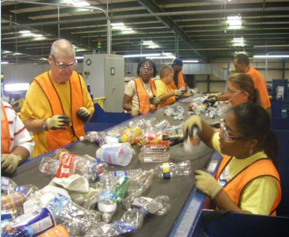
PI employees sort recycling materials that arrive comingled at the Person County Recycling Center.

The Person County Recycling Center (PCRC) will hold a Grand Opening Celebration on September 11–12, 2009. The