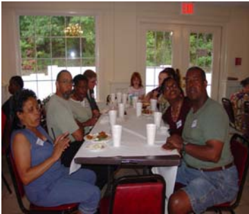
Attendees gather to listen to Awards Ceremony

Attendance at the banquet was the lowest on record due to employee layoffs that occurred earlier in the year. Even so, some 140 people turned out for this evening of appreciation.