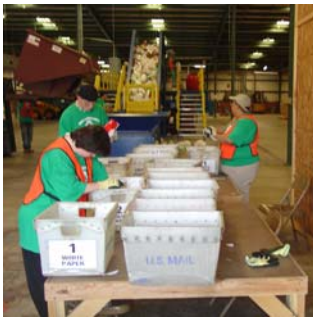
People With Disabilities at Work People with disabilities help sort paper at the Person County Recycling Center (front) and work on materials sort line (back). PI employs more than 100 people with disabilities to meet the demands of our many customers.