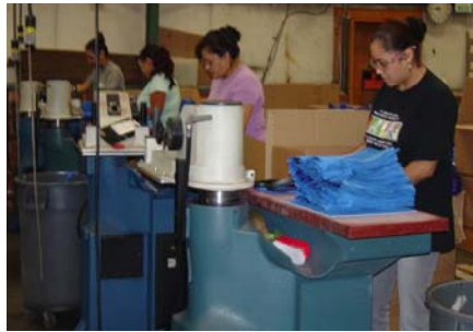
Die-cutters at PI Mfg.

As for employee jobs, downsizing is inevitable. A few employees will be laid off while others will be absorbed into PI operations throughout the county. Still others may be used for the new line of work PI is exploring.