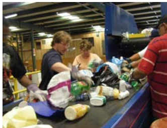
PI Staff learn to sort materials as they move along the conveyor equipment.

located at 601 N. Madison Boulevard, will close on June 27th. All customers are asked to bring their recyclables to the new MRF location at 741 Martin St.