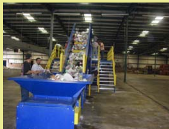
The first run of recyclables at the new MRF

Now that the facility is almost at the opening stage, the persistent question is, what will we call it. Some say we can't call it a MRF because people don't know what a MRF is. So for the sake of clarification we will answer this question—What is a MRF?