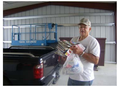
The first customer at the Recycling Center arrived just after 7:00 on opening day.

extremely well. As expected, the employees of PI have stepped up to the task and are performing the sort process in