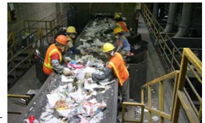
Example of a single stream conveyor at Burbank Recycling, Inc. in Burbank, California.

The contract to build the MRF has been awarded to Davco Steel, Inc. located in Loris, SC.