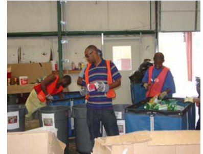
PCRC employees sort through materials received from individuals throughout the area.

So individuals and businesses are encouraged to call or visit our site to see how recycling can be expanded in your home and business for the sake of the environment and increased job opportunities.