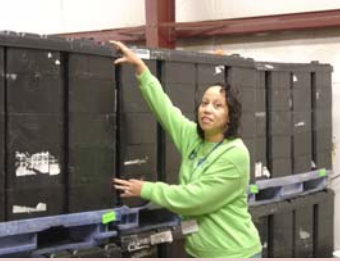
YUVETTE POINTS OUT PROPER HEIGHT FOR WAREHOUSE STORAGE