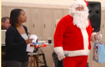
SANTA GIVES OUT GIFTS